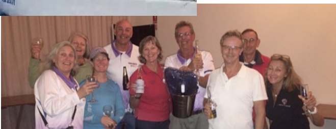
A very happy Ten Sixty crew