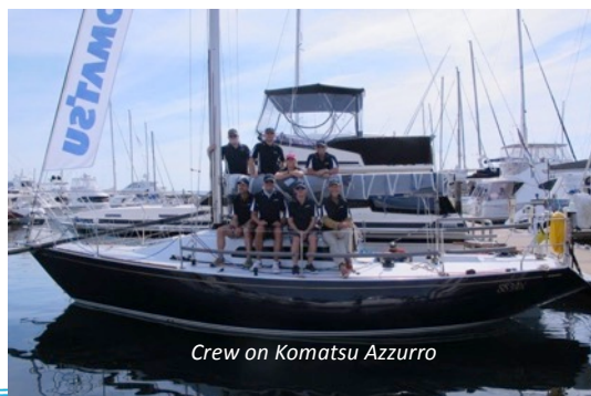
Crew on Komatsu Azzurro